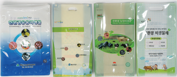
Standing Nbang Pouch (for 2-5 L)