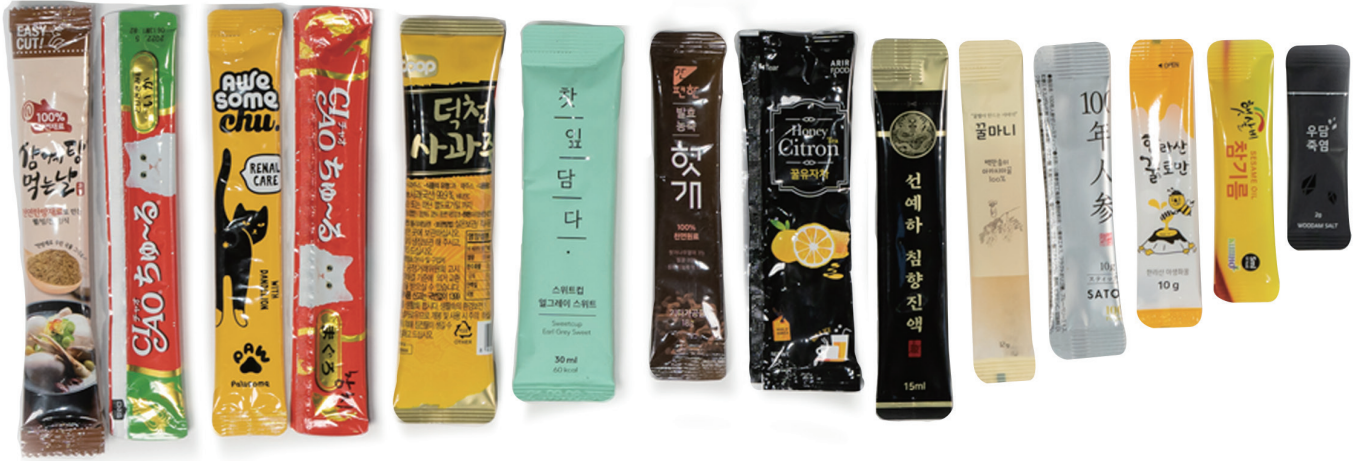
Stick, Liquid, Powder