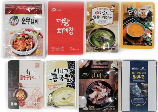
Standing Three - Way Pouch